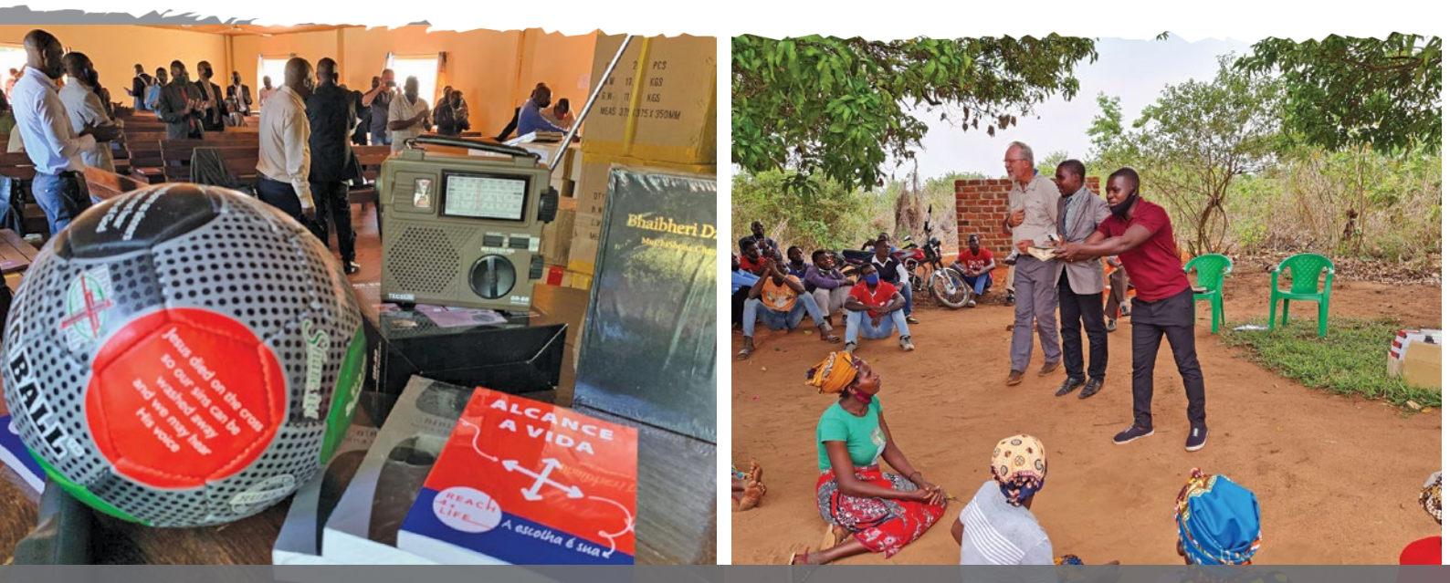
Bibles, Trans World Radios and training were provided. Also a fun Living Ball decorated with the Gospel and a 'Reach for Life' youth Bible packed full of extra resources and lessons inside its pages – were handed out to the youth.